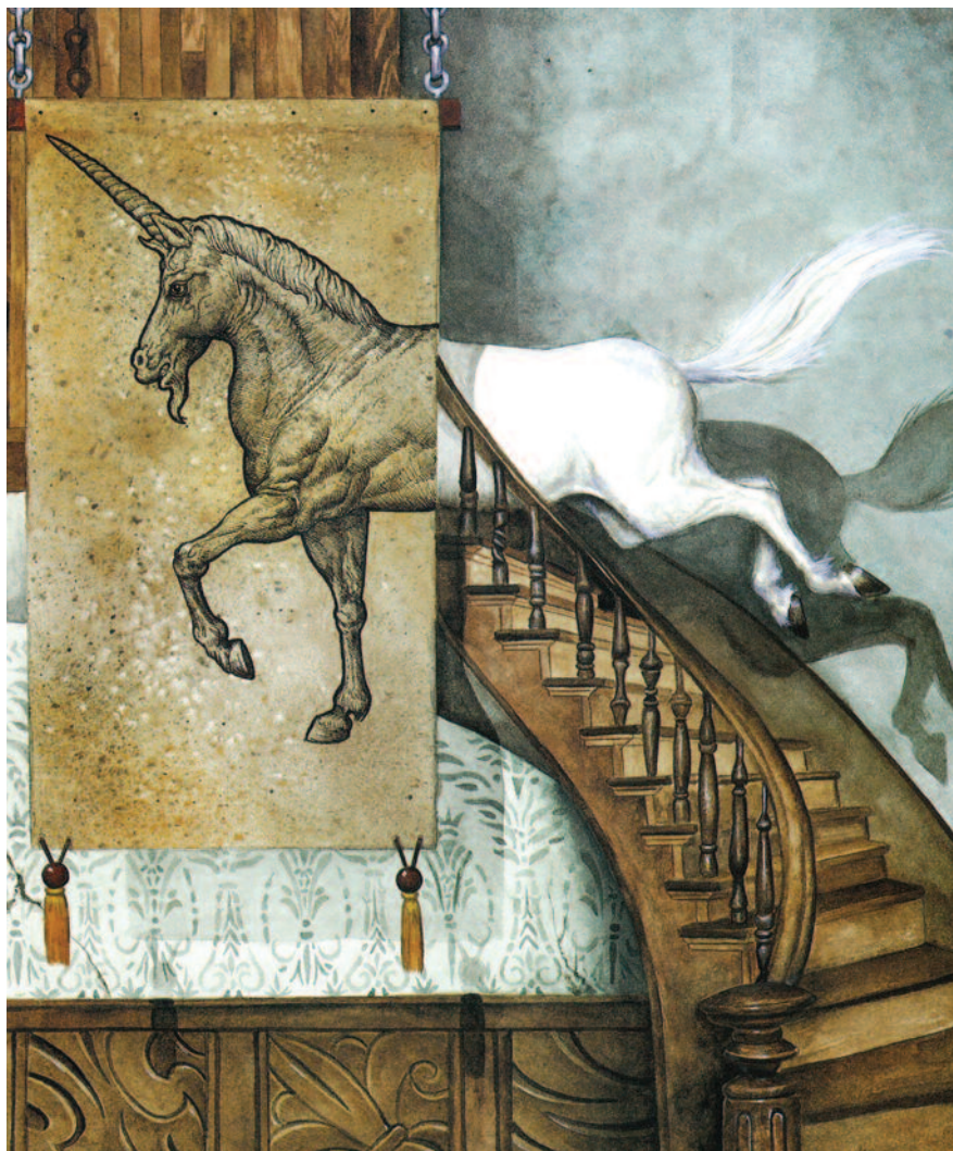
Alphabeasts, Wallace Edwards.

The partnership CEFL has developed with Queen’s Faculty of Education has proved to be an invaluable link to current research that can be disseminated in a palatable form for all those in the field of family literacy who wish to be informed. In order to make good program model choices, the best programs are those that encompass the results of valid research.