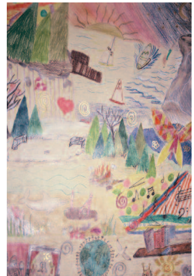
Students' Art Gallery at Hotel Dieu Hospital, Kingston, ON

“Educators who teach for peace must model desired behaviours. We must ‘be the change we want to see’. If all we do is talk about it then our words are empty. ‘Being the change’ is a tall order.”