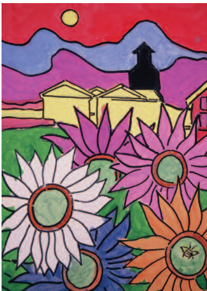
Students' Art Gallery at Hotel Dieu Hospital, Kingston, ON

Communities exist to share something common with one another: physical proximity, beliefs, heritage, interests, and many other identifiers. They have a way of being capable