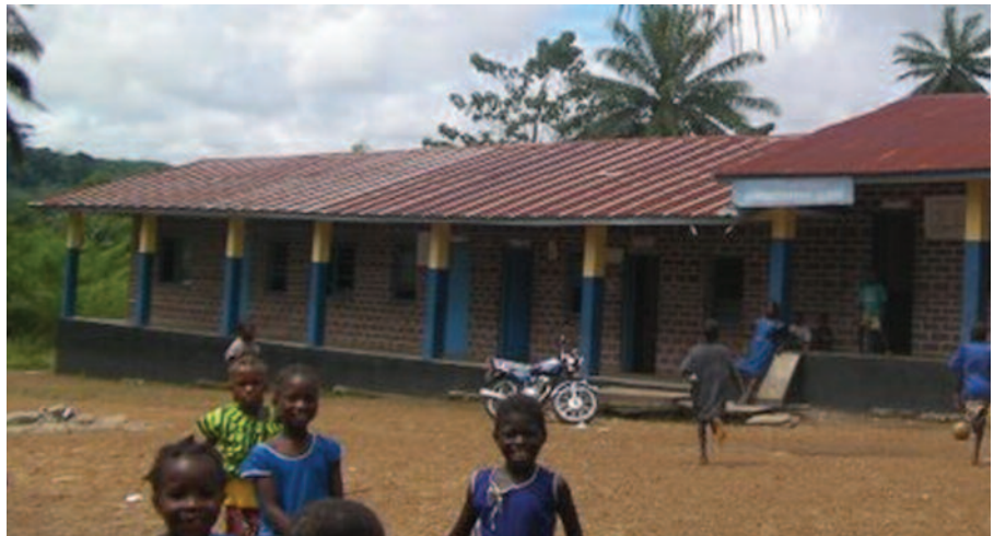
Refurbishing Maso School