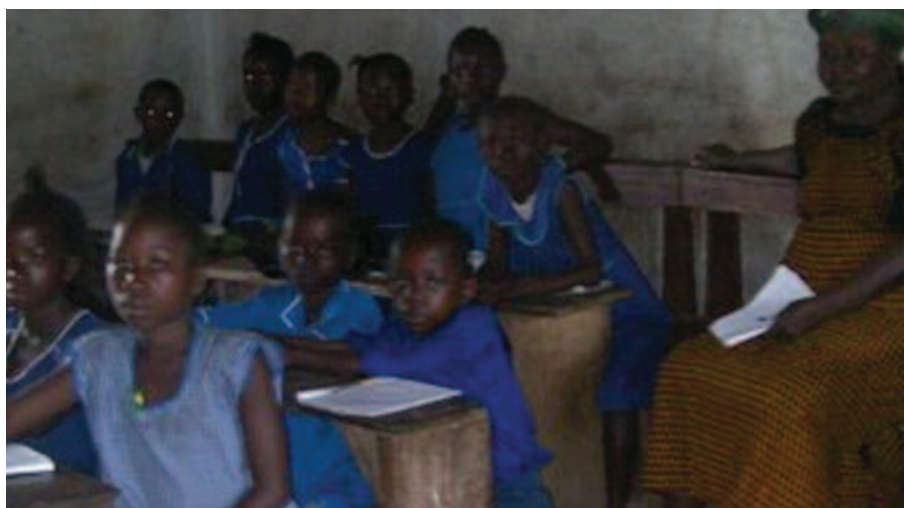
Makonkorie Class Four

Our world and the future of our youth are at stake. Through working together for peace in our hearts, homes, schools, communities, and world, we can contribute to a brighter future for our students and world.