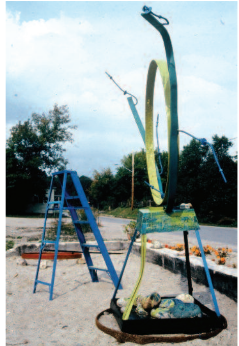
Searching For The Sea Art Installation, Heather O'Reilly, Artist

In conclusion, other aspects of education might feel the influence of this argument. Perhaps teaching must change when it addresses issues that are only possible to comprehend in a different state of being. This moves beyond transmission, construction and critical consideration of knowledge to the territory of engaged action in the world. In the case discussed here, involvement in the world must take a certain ecologically balanced form. It is possible that engagement with other cases, if these exist, will take a different form.